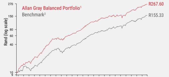
Value of R10 invested at alignment